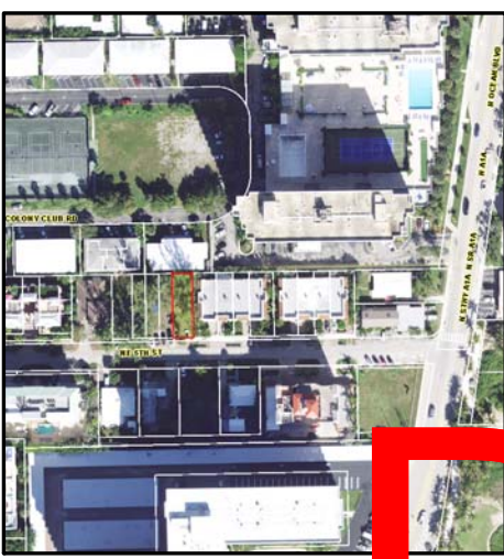
AERIAL MAP (NOT TO SCALE)

FLOOD ZONE INFORMATION Community No. 120055 Panel No. 0377 Suffix: L FIRM Date: 09-11-2009 Flood Zone: AE + 5'